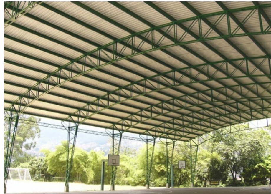
Colegio San José.

Client: Municipio de Envigado Year: 1997