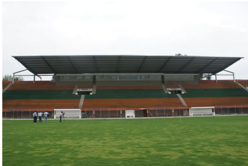
Estadio de Envigado.

Client: Municipio de Envigado Year: 1997