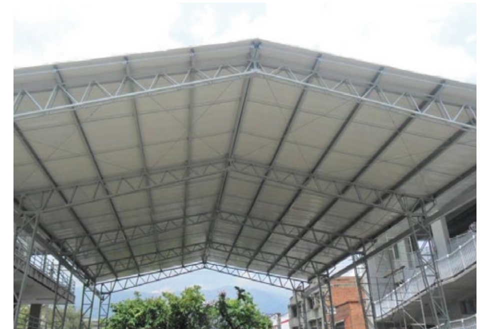
Colegio El Carmelo.